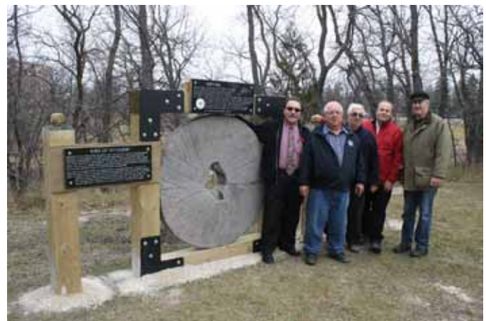
St. Clements Heritage Advisory Committee

Virden's Downtown Heritage District Project is in its early stages. The first step in the creation of a Downtown Heritage District was the completion of an inventory of the buildings within the proposed boundaries of the district. That inventory included research into origins, builders and owners, as well as