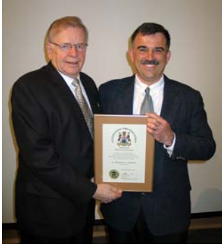
Centennial Organization Award 1978