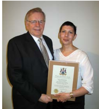
Margaret McWilliams Award 1978