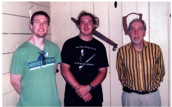
Three men, one with a sword on his back and another with a scythe on his back.