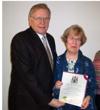
Margaret McWilliams Award 1978