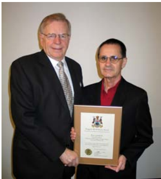
Margaret McWilliams Award 1978