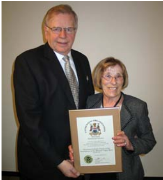
Centennial Organization Award 1978