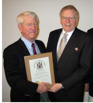
Centennial Organization Award 1978