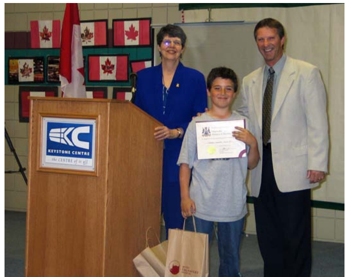
Manitoba Métis Federation, the Manitoba Historical Society, The Seven Oaks Residents' Association, the