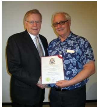
Margaret McWilliams Award 1978