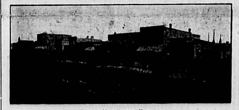
PART OF MAIN STREET, HARTNEY