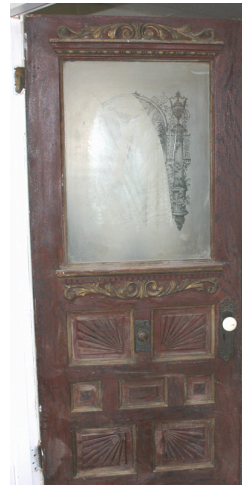
This weathered old door is well worth re-finishing.

Although there are materials that imitates a wood finish in a variety of styles may seem appropriate for your home, they are not recommended. A lot of the character that is found in the specific features heritage homes comes from the aging of materials. Although other materials may be able to imitate a new wood door, they will not age in the same way. For this reason, imitations are not recommended.