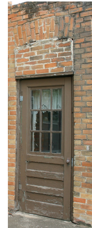
A transom window has been filled in substantially altering the appearance and functionality of this entranceway.