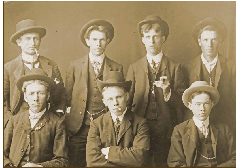
Some of the same faces.