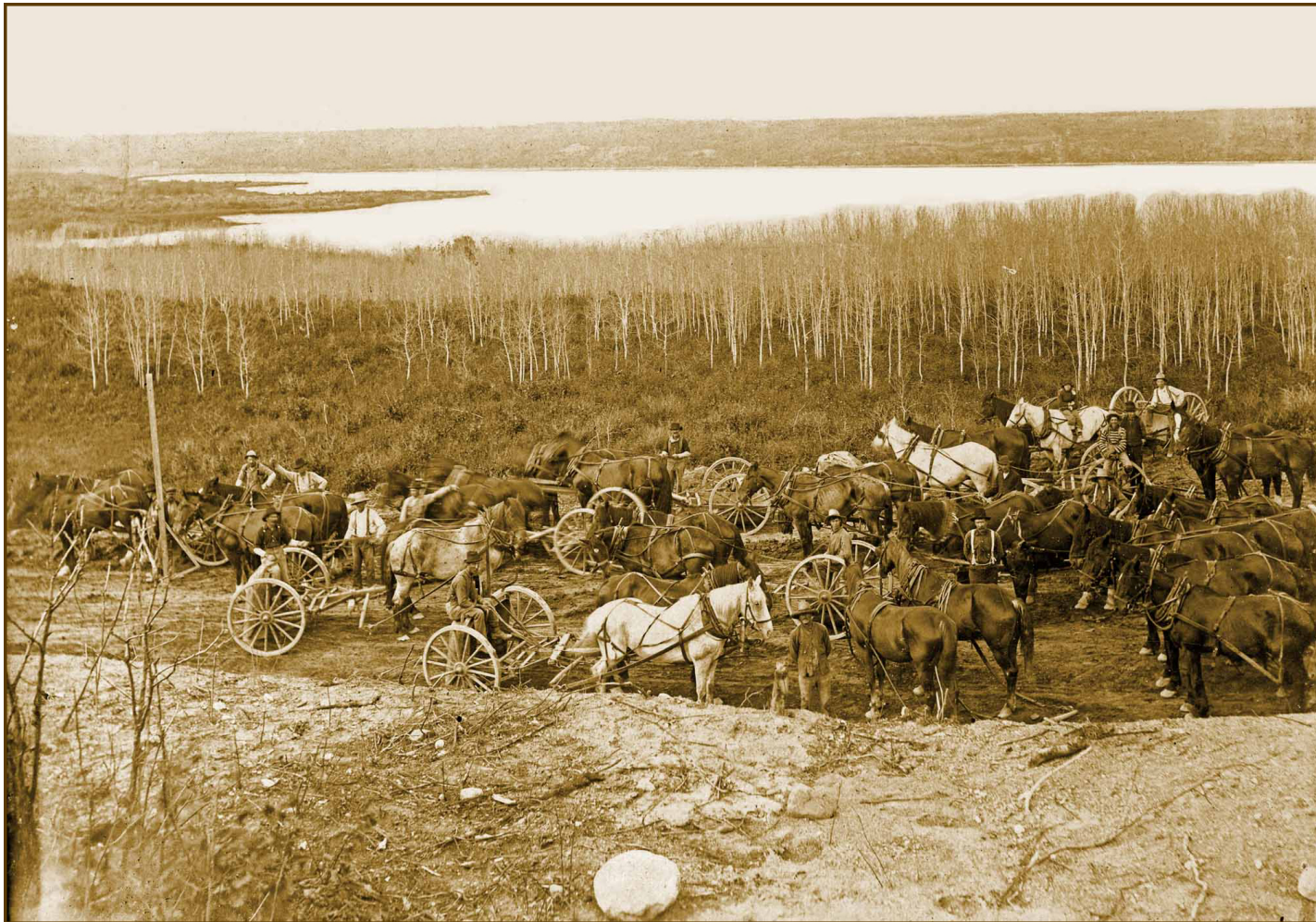
Grading the "Wakopa Branch" near the site of Neelin, with Lake Louise in the background.