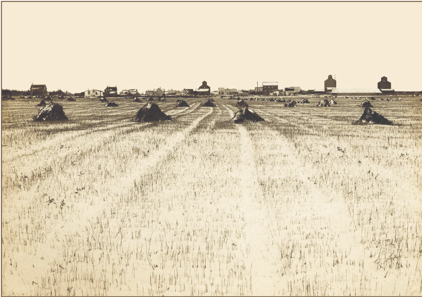
A wide view from the south, dated Sept. 13, 1903. That is snow on the ground!

From the September 17, Baldur Gazette; "This is one of the worst falls our farmers have had to contend with. All unstacked grain was saturated through and through by Saturday's big rain and snow storm, and it is feared that a great many of the stacks have let in the wet."