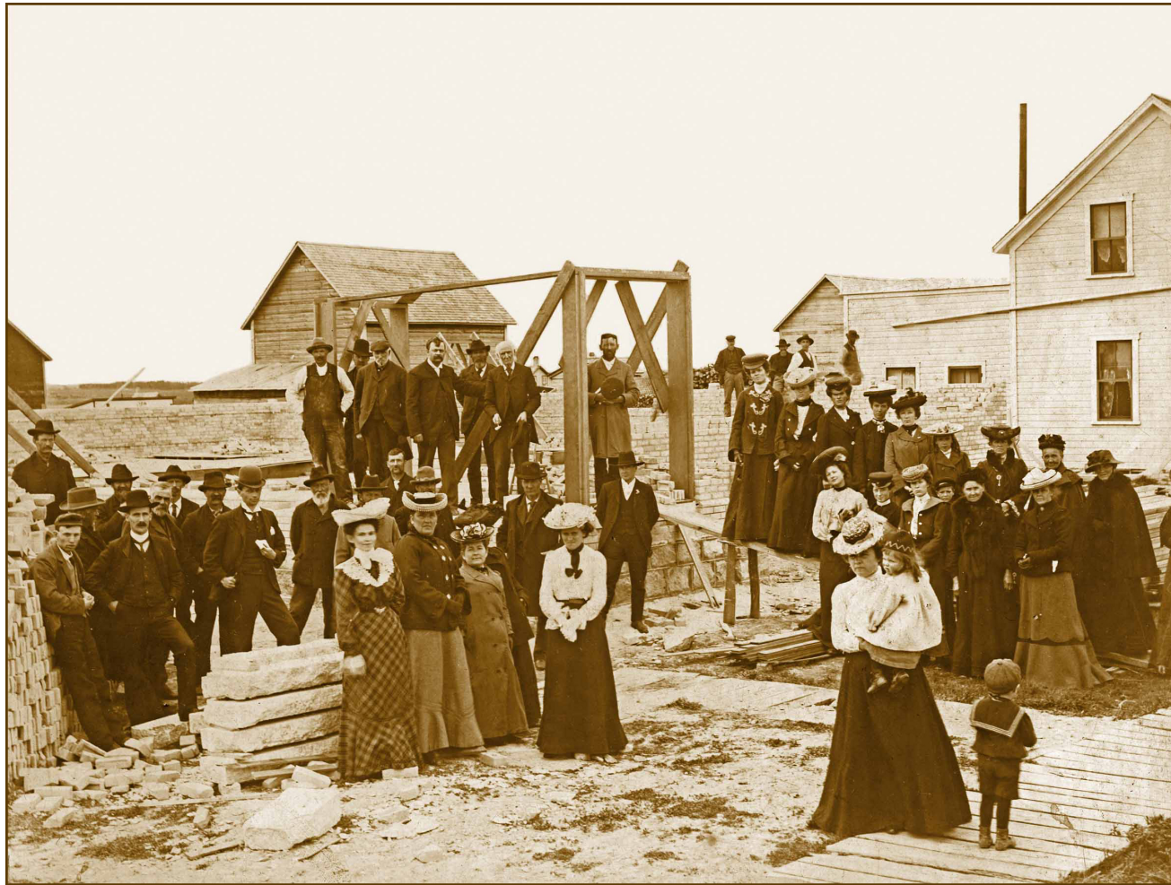
Construction of the Baldur Methodist Church in 1904.