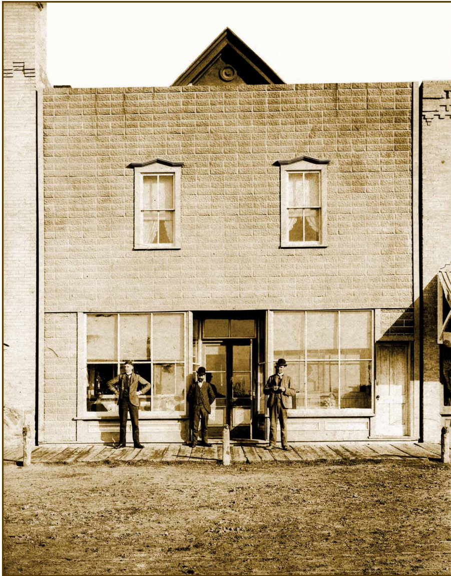
Baldur Drug Store