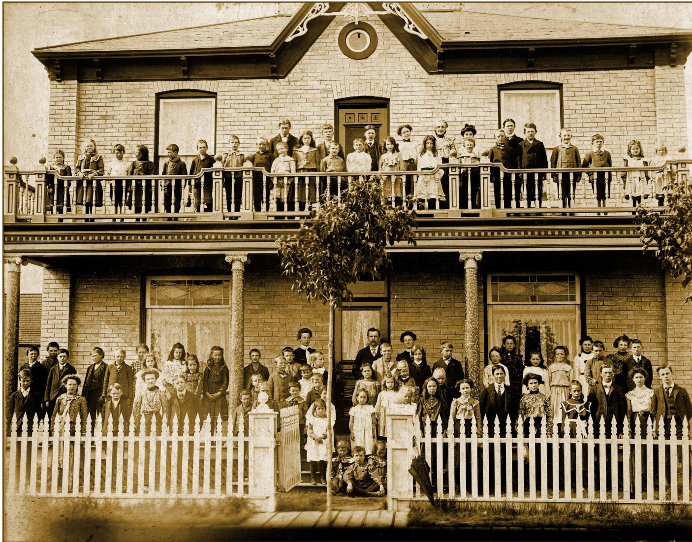
The Fowler House – hosting Students and Staff from the Simpson School